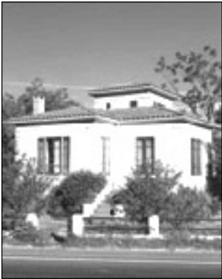
MURER HOUSE IN FOLSOM